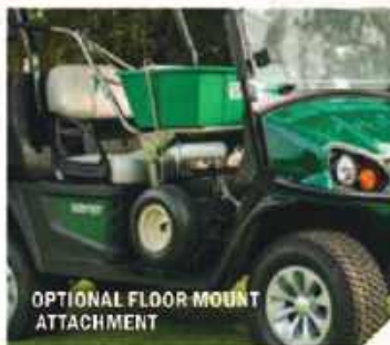
OPTIONAL FLOOR MOUNT ATTACHMENT