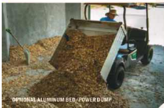
OPTIONAL ALUMINUM BED/POWER DUMP