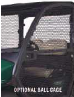
OPTIONAL BALL CAGE