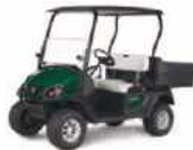
Hauler 800X ELITE