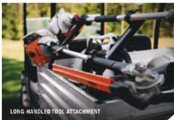
LONG-HANDLED TOOL ATTACHMENT