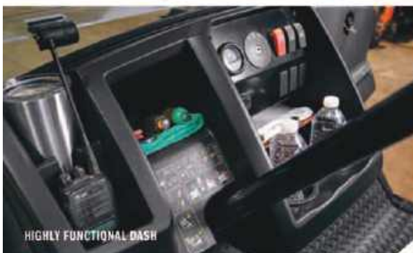
HIGHLY FUNCTIONAL DASH