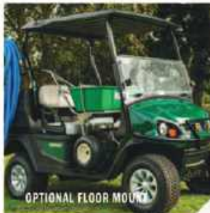
OPTIONAL FLOOR MOUNT