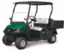
Hauler 800 ELITE