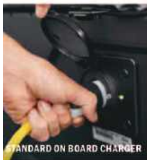
STANDARD ON BOARD CHARGER