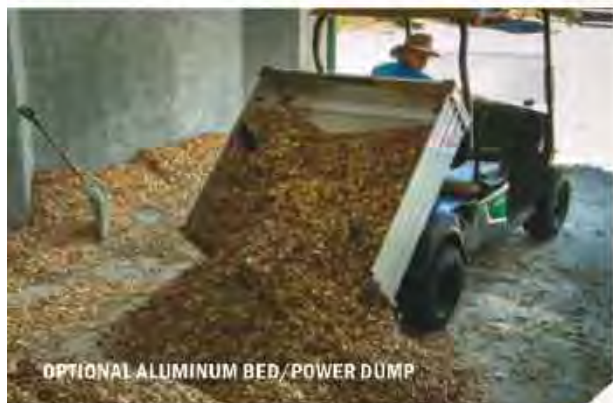
OPTIONAL ALUMINUM BED/POWER DUMP