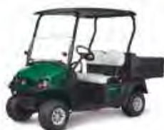
Hauler 800 ELITE