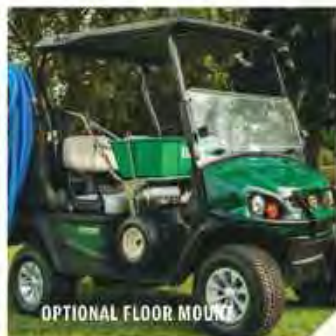
OPTIONAL FLOOR MOUNT