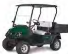
Hauler 800X ELITE