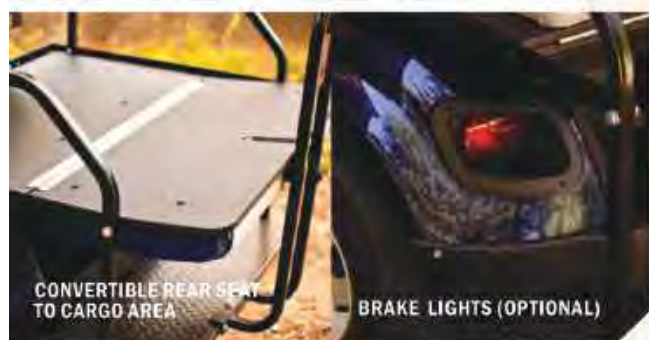
CONVERTIBLE REAR SEAT TO CARGO AREA