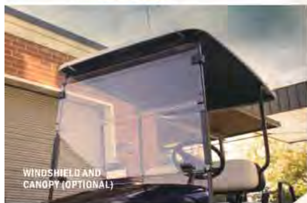
WINDSHIELD AND CANOPY (OPTIONAL)