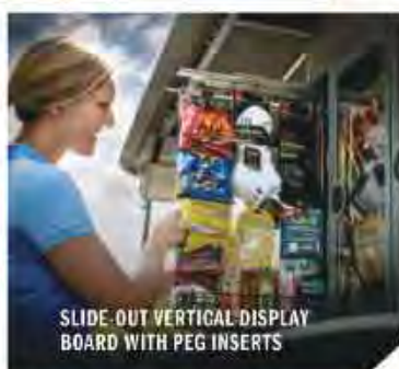
SLIDE-OUT VERTICAL DISPLAY BOARD WITH PEG INSERTS