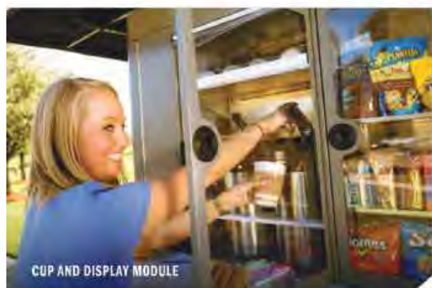
CUP AND DISPLAY MODULE