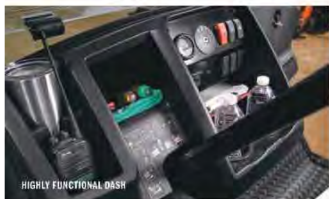
HIGHLY FUNCTIONAL DASH