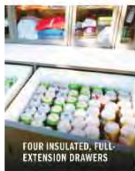
FOUR INSULATED, FULL- EXTENSION DRAWERS