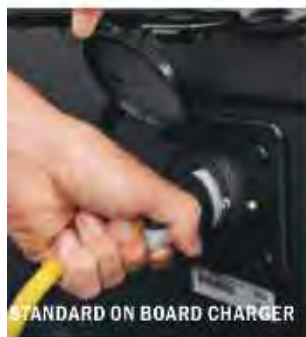
STANDARD ON BOARD CHARGER