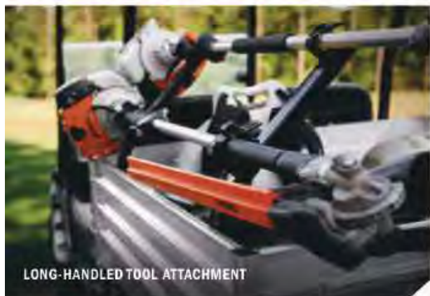
LONG-HANDLED TOOL ATTACHMENT