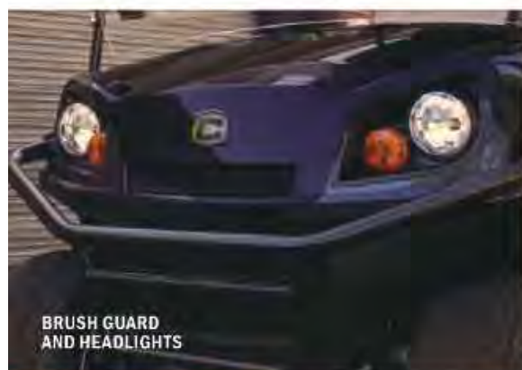
BRUSH GUARD AND HEADLIGHTS