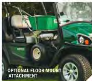
OPTIONAL FLOOR MOUNT ATTACHMENT