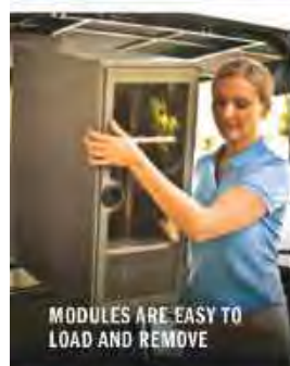
MODULES ARE EASY TO LOAD AND REMOVE