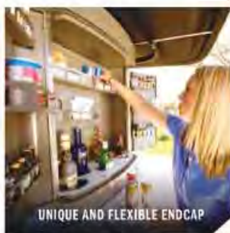
UNIQUE AND FLEXIBLE ENDCAP