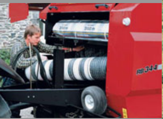
A maximum of six spools of twine helps ensure a full day's baling.

Excellent accessibility and loading of twine or net.