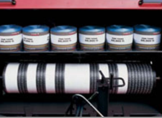
The RB 344 SILAGE-PACK. Prolonged crop exposure or loss of quality due to changes in weather conditions is eliminated.