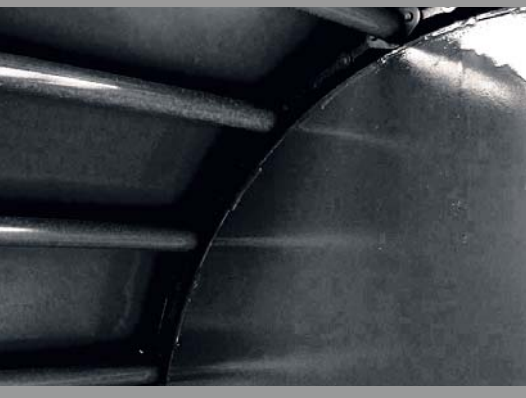
Density control system is ideal for producing dense bales in all crop conditions.