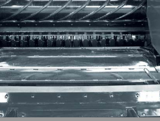
Bale rotation bars provide positive crop movement in all conditions.

Heavy duty floor roller provides gentle but firm rotation while supporting the weight of the bale.